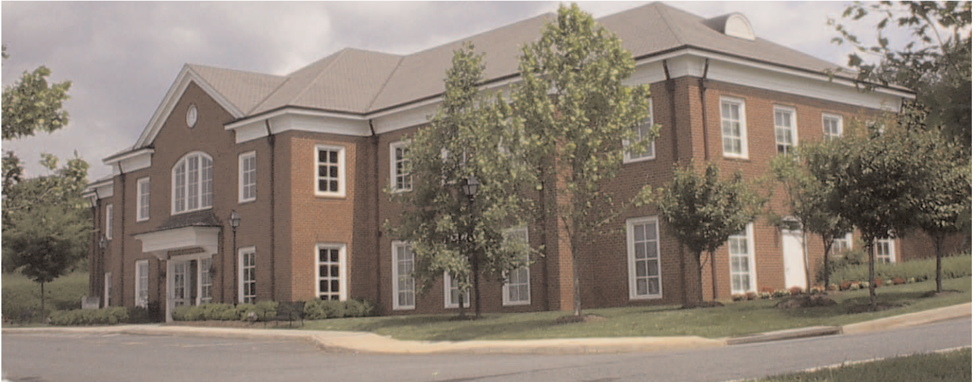
Proposed building similar to Martha Jefferson building, 1490 Pantops Mountain Place

At Westminster Canterbury & Peter Jefferson Place Charlottesville, Virginia